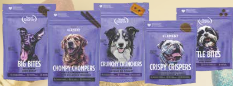
MANY VARIETIES AND FLAVORS OF TREATS TO CHOICE FROM

NutriSource Treats & Supplements Mention this ad to receive 10% off treat purchase