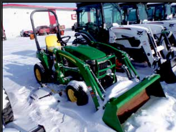
2007 John Deere 2305 Loader, Mower, 520 Hours