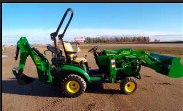
2023 John Deere 1025R Hydro Loader, 206B Backhoe w/Clamp and Bucket, Factory Warranty, 3.2 Hours