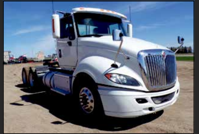
2015 International Prostar ISX, 450 HP, 10 Speed Manual, 194" Wheelbase, 350,000 Miles