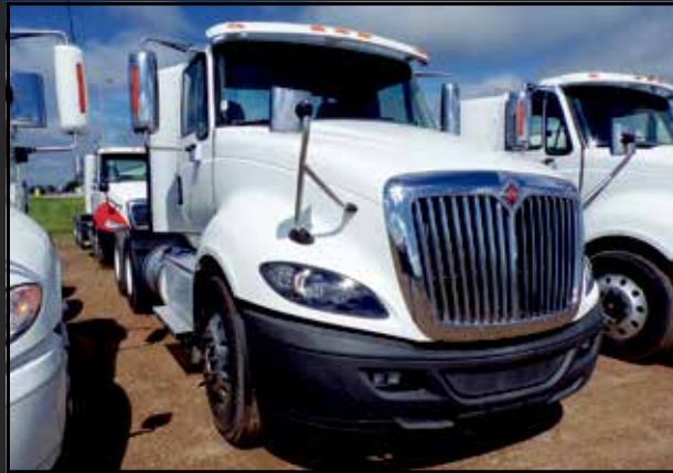
2017 International Prostar ISX, 425 HP, 10 Speed Manual, 185" Wheelbase, 445,540 Miles