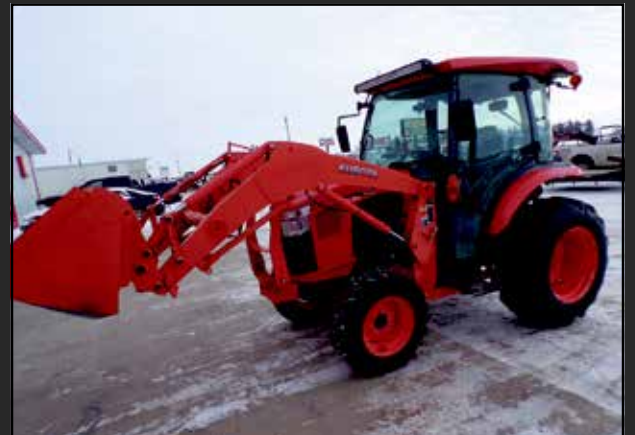
2013 Kubota L3560 HST Cab, Loader, 4WD, AC/HT, 1900 Hours