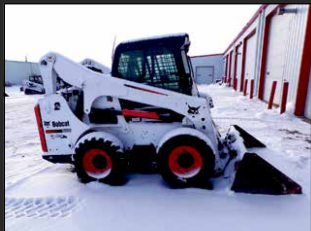
2015 Bobcat S750 2 Speed, AC/HT, Radio, 2000 Hours