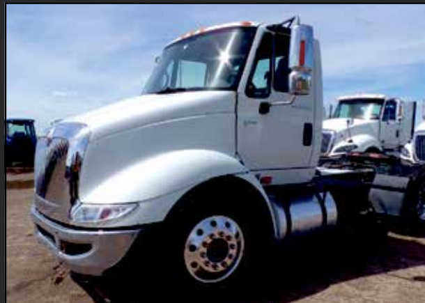
2005 International 8600 ISM, 370 HP, 10 Speed, 179" Wheelbase, Air Ride, 465,000 Miles