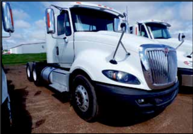
2017 International Prostar ISX, 450 HP, 10 Speed Manual, 185" Wheelbase, 491,840 Miles

USED EQUIPMENT FROM A NAME YOU CAN TRUST!