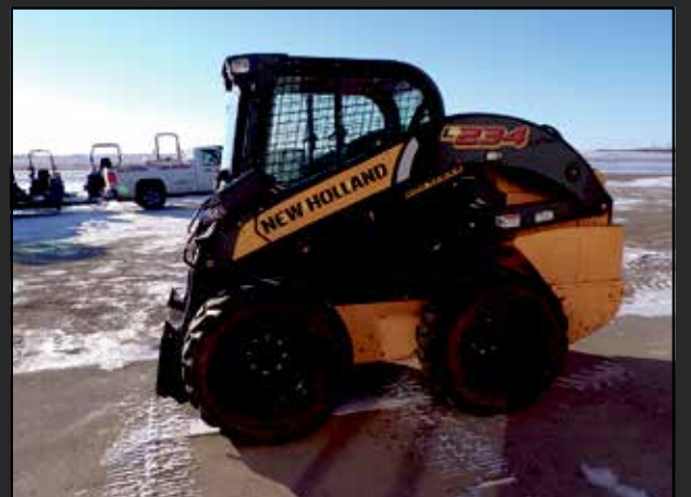
2018 New Holland L234 2 Speed, AC/HT, Hi-Flow, 1520 Hours