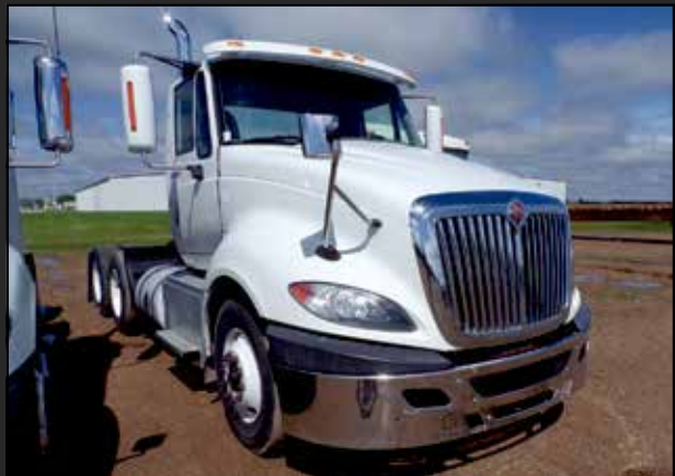
2014 International Prostar ISX, 450 HP, 10 Speed Manual, 175" Wheelbase, 352,444 Miles