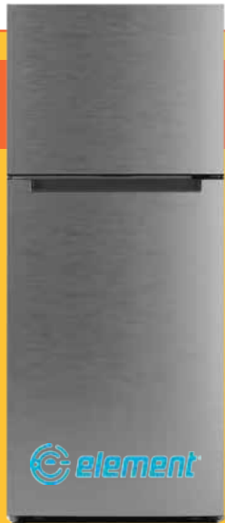
17.6 CF TOP FREEZER REFRIGERATOR SALE $599.99 WAS $769.99