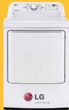
7.3 CF ULTRA LARGE CAP. ELECTRIC DRYER SALE $649.99 WAS $849.99