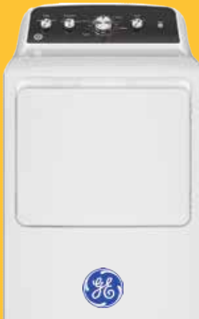
7.2 CF ELECTRIC DRYER SALE $549.99 WAS $799.99