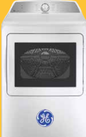
7.4 CF ELECTRIC SENSOR DRYER WHITE SALE $649.99 WAS $899.99