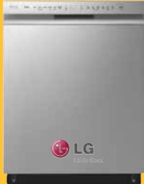
24" FULL CONSOLE DISHWASHER SALE $599.99 WAS $899.99