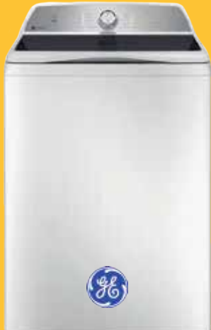
4.9 CF TOP LOAD WASHER WHITE SALE $649.99 WAS $899.99