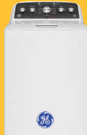
4.5 CF TOP LOAD WASHER SALE $549.99 WAS $799.99